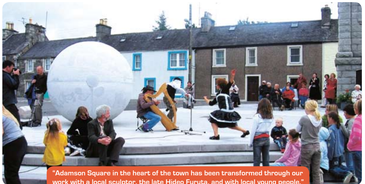
"Adamson Square in the heart of the town has been transformed through our work with a local sculptor, the late Hideo Furuta, and with local young people."

Adamson Square in the heart of the town has been transformed through our work with a local sculptor, the late Hideo Furuta, and with local young people. It now reflects our heritage, using representations of stake nets and waves and a large granite globe carved with the town's history. We've also recently been awarded £50,000 from the Scottish Arts Council's 'Inspire' initiative to run arts events in the Square to get local people, well, inspired.